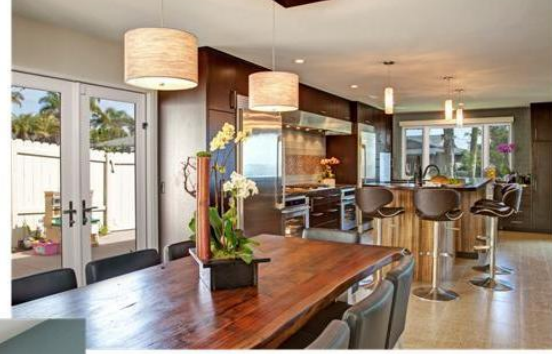
Best Large Kitchen 2013